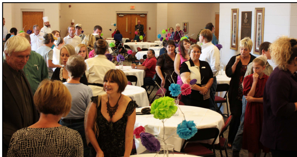
Scholarship recipients, their families, donors, faculty, and staff filled the Lobby of the John E. Miller Building for the reception.