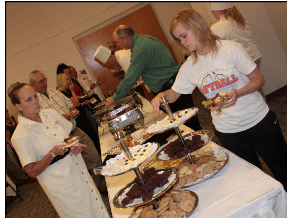
Guests enjoyed refreshments prepared by Culinary Arts students.