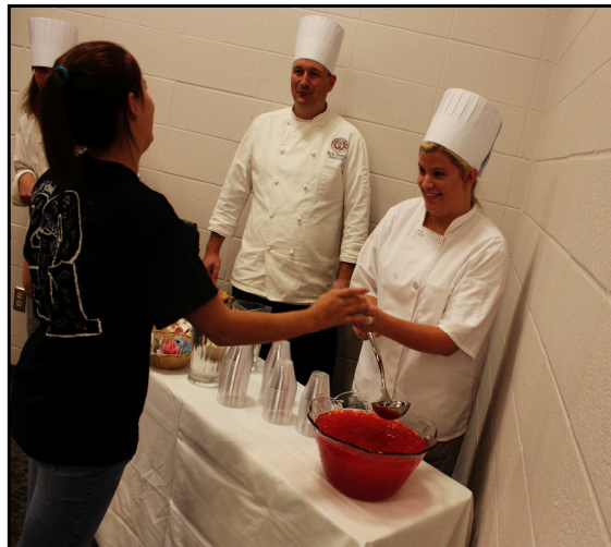
Guests were served punch at the event.