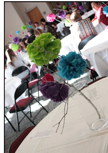
The table decorations were created by the Advancement Department.