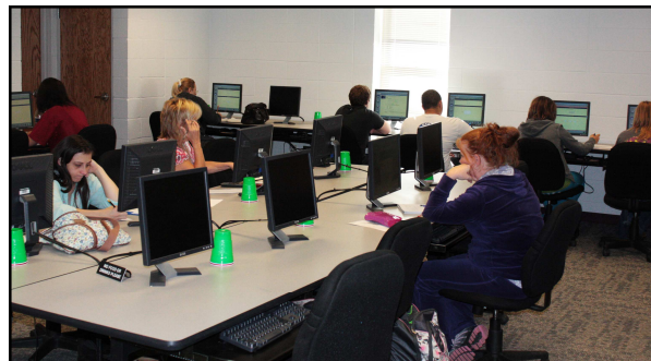
Students can use the computer labs to write assignments, print papers or complete online research.

The Ash Flat computer lab is also used as a