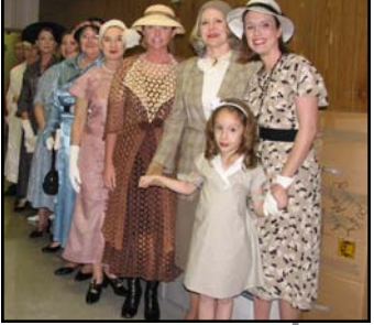
Volunteer models get ready to hit the runway!

ing home residents who were shown The Grapes of Wrath movie during January and February.