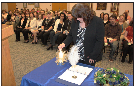
Students signed their names into the PTK book and lit a candle as part of their induction.

On Thursday, Feb. 16, 50 Ozarka College students were inducted into the Beta Alpha Eta Chapter of Phi Theta Kappa Honor Society. This society serves to recognize and encourage the academic achievement of two-year college students and provide opportunities for individual growth and development through honors, leadership and service programming. It is the largest honor society in American higher education with more than 2.5 million members and 1,275 chapters. In 1929, the American Association of Community Colleges recognized Phi Theta Kappa as the official honor society for twoyear colleges.