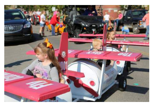
The kid's plane ride made for a great time at the Cushman Miner's Day parade and festival on October 10, 2015.