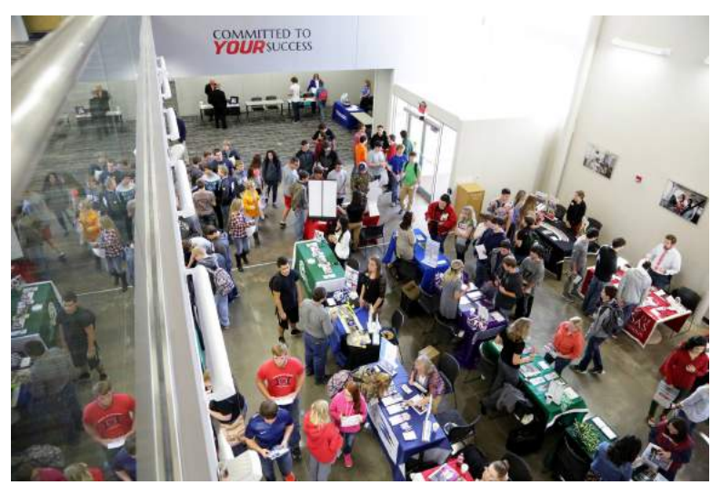
10/27: Students from area high schools, as well as College staff and students participated in American Voices: Bullying Prevention, hosted by the Diversity & Cultural Arts Committee. 10/31: Students at Mammoth Spring helped with the community Spooktacular event.