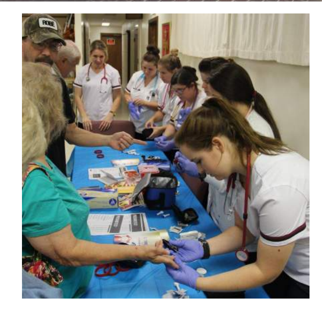
I 1/2: Nursing students from the Ash Flat program helped with a diabetes seminar, hosted by White River Medical Center. 11/10: The Mammoth Spring campus hosted a live remote and collected non-perishable food items for the Hunger Hero Campaign.